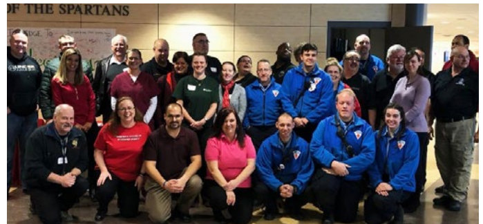
EMS professionals from CCAC and the region pause for a photo during a training at Montour School District.