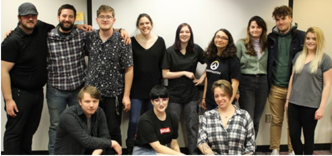
Posing for a photo are staff members of CCAC's multiple award-winning student newspaper, The Voice .