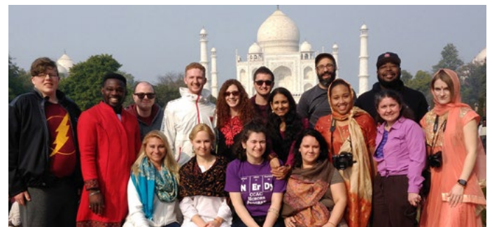
CCAC Honors students and faculty members gather for a photo in front of the historic Taj Mahal during their study tour in India.